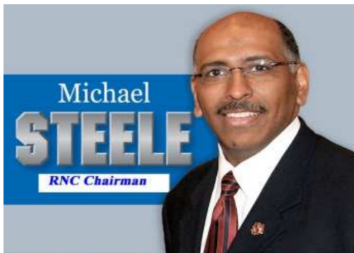
The Democrats' Worst Nightmare The New Head of the Republican Party

Instead of bringing items to this month's meeting for the Fisher House, we're asking members to bring cash donations or your tax-deductible check made out to the Fisher House.