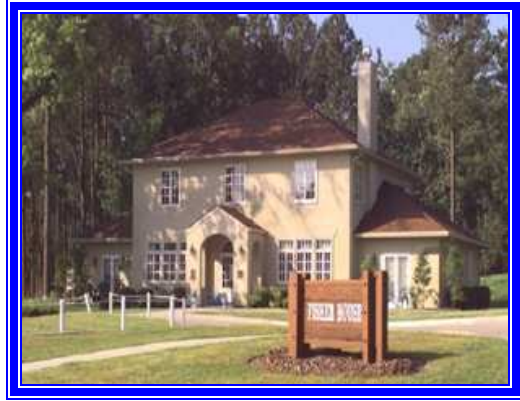
THE FISHER HOUSE at FORT BRAGG

June 10, 2008 CCRWC Board Meeting June 13 th & 14 th GOP State Convention