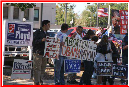
Republican's gather in front of the Board of Elections Headquarters.