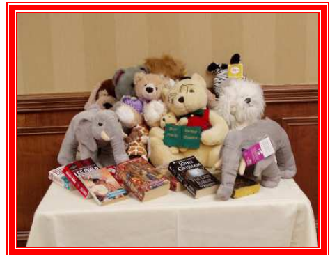
Stuffed Animals collected for the Children's Ward at Womack Hospital and Paperback Books for the Families visiting at Fort Bragg.