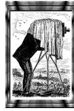
Our October Meeting