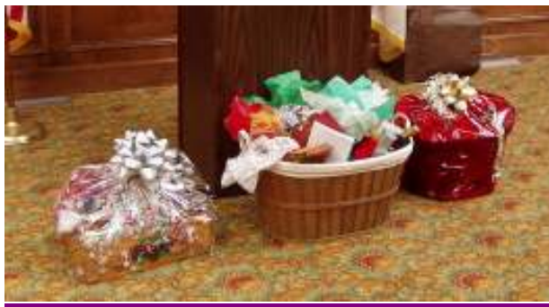
2008 Christmas Baskets

Each year our membership donates items for our annual Christmas basket raffle. In previous years, our baskets have been the talk of the town.